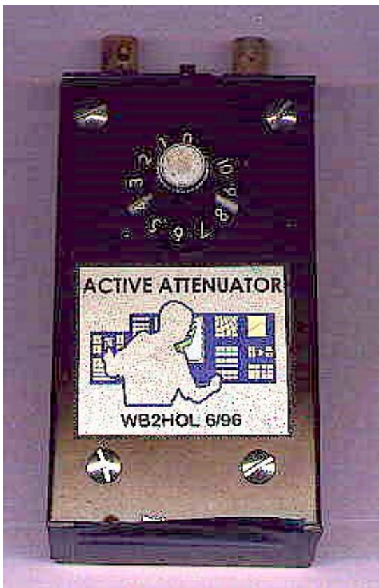
FRONT VIEW OF ACTIVE ATTENUATOR

I used a 1 MHz crystal oscillator and it made construction even simpler than the original unit.